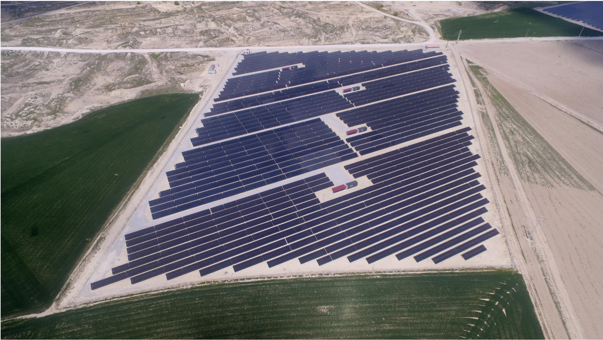
KONYA EGRIBAYAT 4 MW