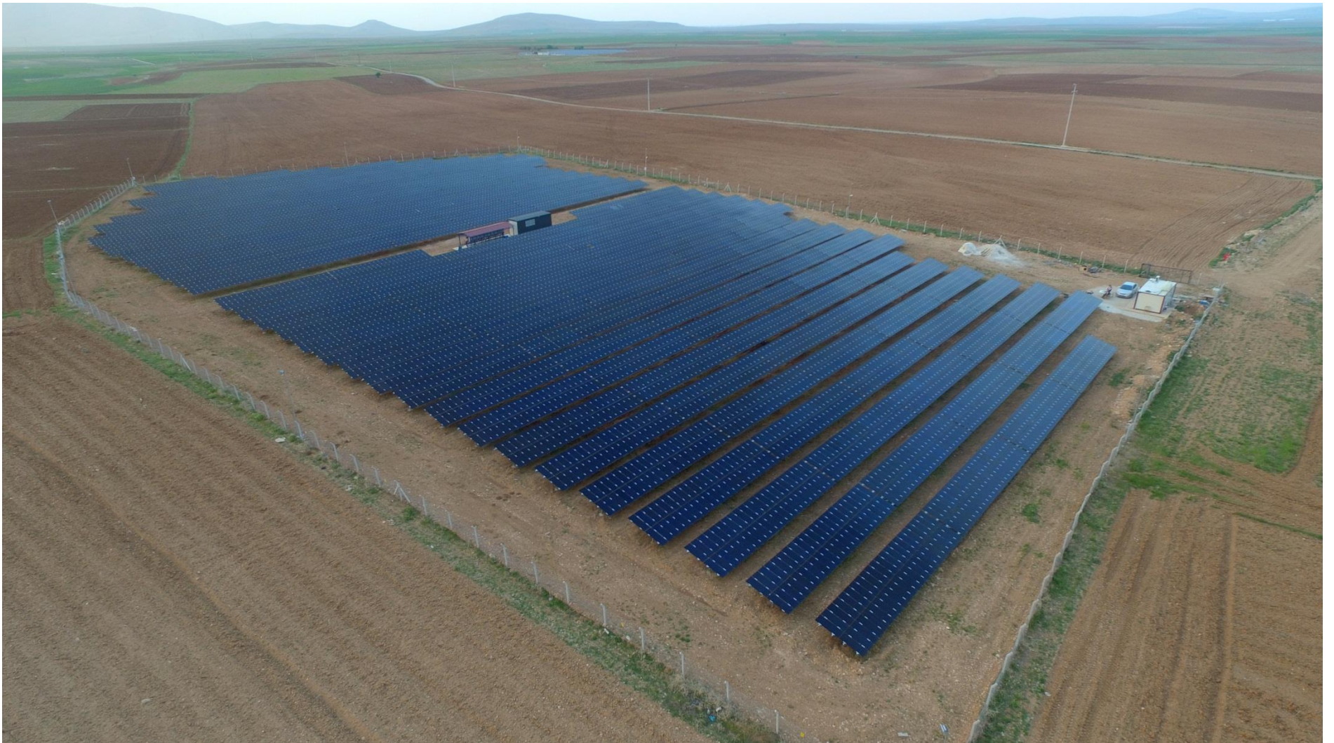
KONYA ÇUMRA 1 MW THIN FILM